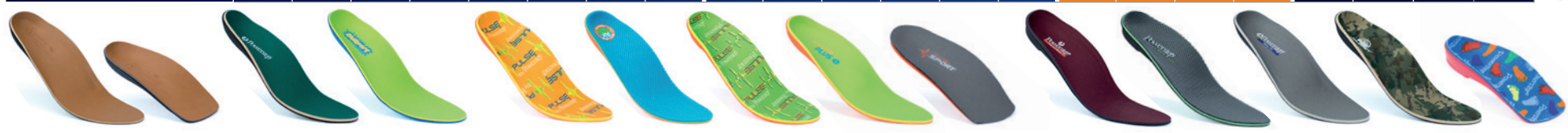
Signature Dress ArchLite® KidSport® PULSE® PULSE® Air PULSE® Maxx PULSE® +Met Sport ¾ Pinnacle Maxx Breeze Maxx Wide Fit Journey® Hiker PowerKids®