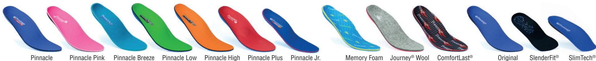
Pinnacle Pinnacle Pink Pinnacle Breeze Pinnacle Low Pinnacle High Pinnacle Plus Pinnacle Jr. Memory Foam Journey® Wool ComfortLast® Original SlenderFit® SlimTech®